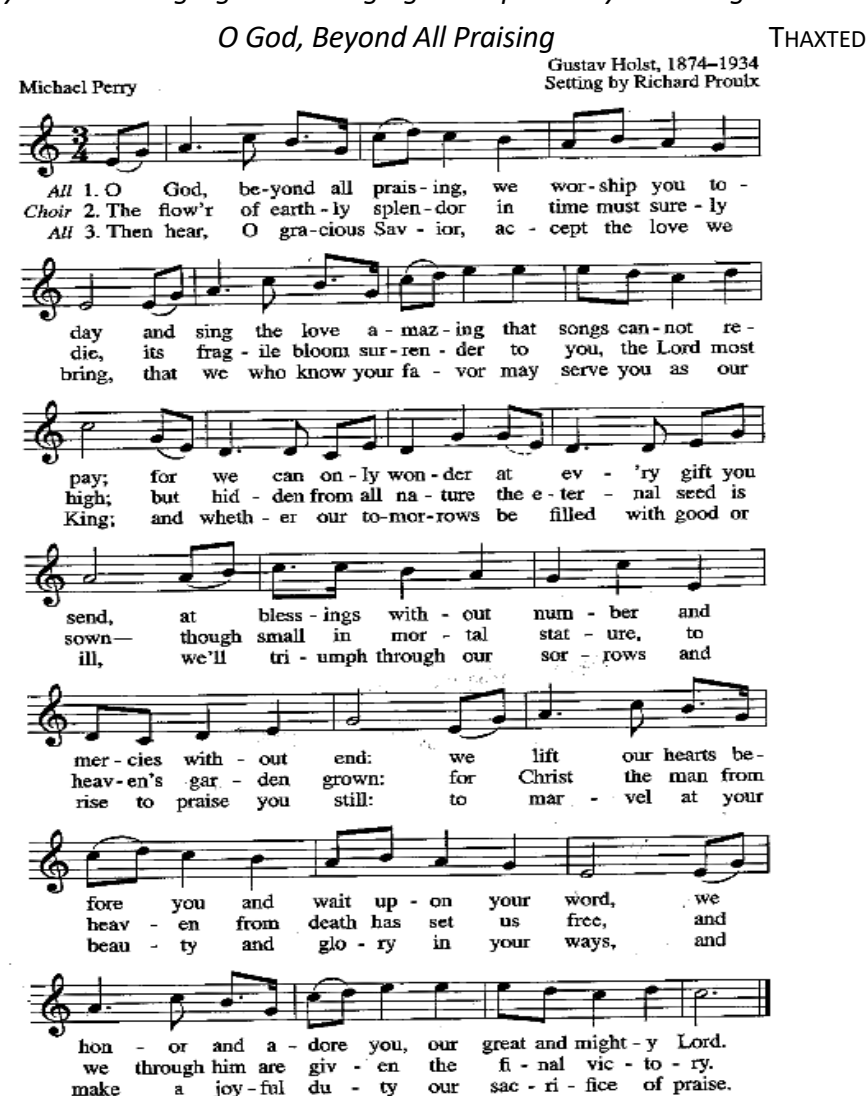
"O God, Beyond All Praising" Words Copyright © 1982, 1987 Hope Publishing Company, Carol Stream, IL 60188. All rights reserved. Used by permission. Setting Published 1988 by GIA Publications, Inc.

The cathedral choir will lead the hymns. Congregants are welcome to hum at the hymns but congregational singing is not presently encouraged.