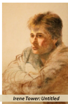
Irene Tower: Untitled