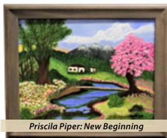
Priscila Piper: New Beginning