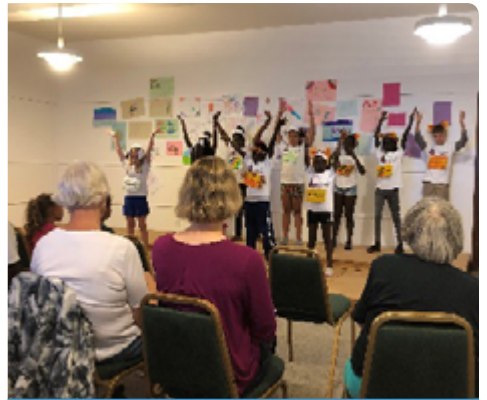
Cast members performing for an enthusiastic audience