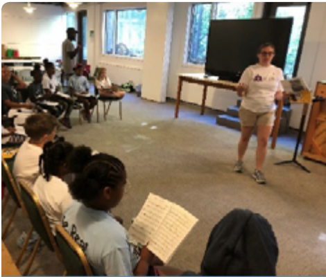
Camp members in rehearsal