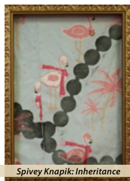
Spivey Knapik: Inheritance