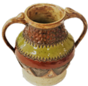
Shelly Thompson: Pottery